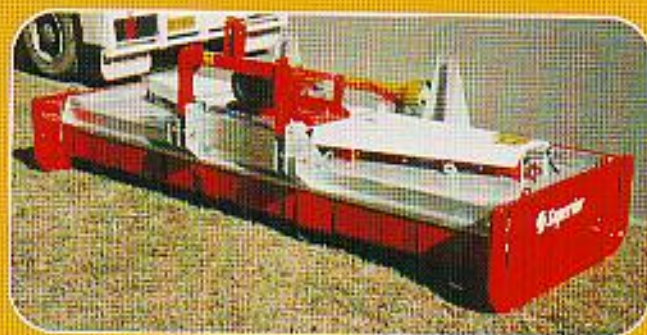
Skid Version PBL300 with Galv. Body and One Way Front Paddles.