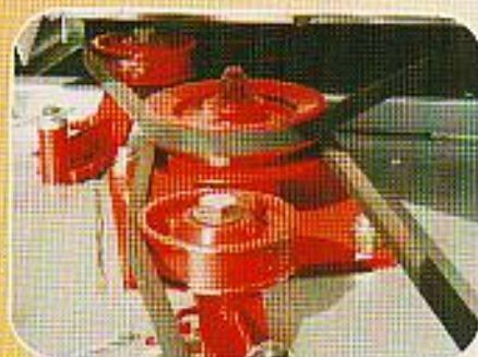
C-Section Belt Drive with Solid Steel Pulleys and Idler Arm Adjustment.

Superior Equipment Australia Pty. Ltd. 200 50 054 422 002